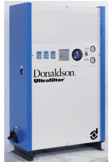
Purification package OFP

In case of an immediate increase in differential pressure, the differential pressure gauge triggers the control and a valve (9) is closed.